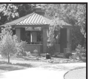
Plan today, for peace of mind tomorrow

Meeting 1st Thursday of Each Month a 683 McEwan Ave. Call 519.981.7895 Special thanks to Blak's Baker